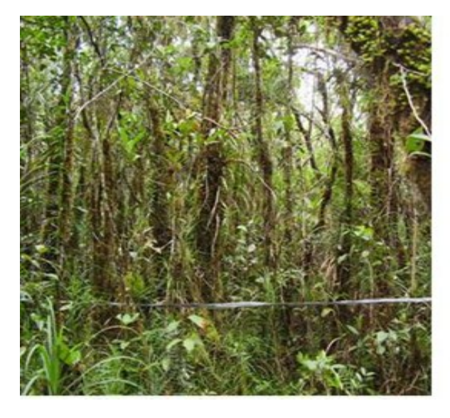
Figure 7. Mossy forest at San Isidro, Davao Oriental

common species or 6% followed bv dipterocarp forest and montane forest with only 1 common species or 5%. Only one common species or 4% also was found in agroecosystem and montane forest. However, agroecosystem and dipterocarp forest showed no common species of shrubs that could be due to the absence of relevant faunal species associated with the species of shrub (Table 1).