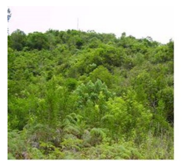
Figure 5. Agroecosystem at Governor Generoso, Davao Oriental

the distances of vegetation types that facilitate the easier dispersal of seeds by forest interior birds in neighboring sites. Based on the data gathered, the highest shrub species similarity index was obtained between montane forest and pygmy forest (Fig 8) with ten common species or 29% followed by dipterocarp forest and pygmy forest with two common species or 7%. Agroecosystem and pygmy forest showed 2