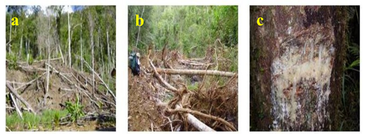
Figure 3. Photographs of the present problems of the area such as (a) logging, (b) development of roads for mining activities and (c) extraction of almaciga resin for fuel