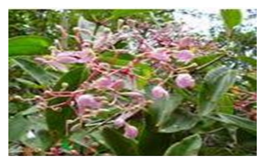
Figure 4. Medinilla apoensis C. B. Rob. MELASTOMATACEAE

that include temperature, rainfall and relative humidity. Among the species of shrubs, Medinilla apoensis (fig. 4) showed the highest species importance value of 126.7% followed by Drimys piperita with 83.19% and Melastoma malabathricum with 73.91%. For the montane forest, Melastoma malabathricum was the most important species with 126.7% and Vaccinium gitingense in the pygmy forest with 67.37%. The high species importance values in this vegetation type could be due to the seeds and fruits that are easily carried by animals or some environmental gradients, not easily attacked by fungi and bacteria, and any amount of moisture that is enough for the seeds to grow abundantly. These species have an important role in regulating the stability of the ecosystem.