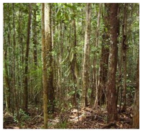
Figure 6. Dipterocarp forest at Mati, Davao Oriental

common species or 6% followed bv dipterocarp forest and montane forest with only 1 common species or 5%. Only one common species or 4% also was found in agroecosystem and montane forest. However, agroecosystem and dipterocarp forest showed no common species of shrubs that could be due to the absence of relevant faunal species associated with the species of shrub (Table 1).