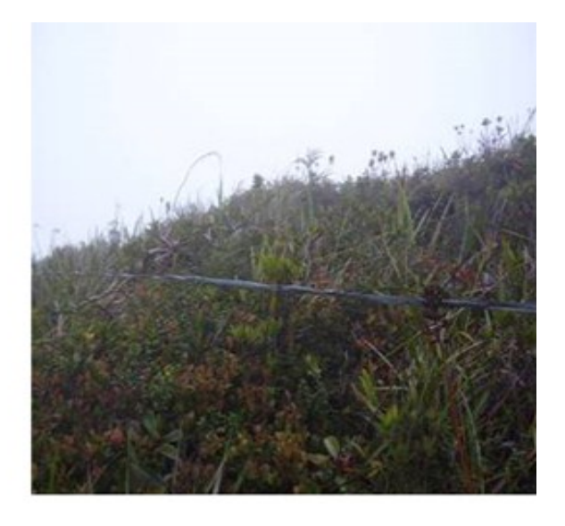
Figure 8. Pygmy forest at San Isidro, Davao Oriental